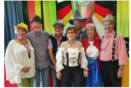
Members of The Germania Club