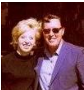
With Bill Haley in 1965