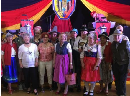
The German Friendship Group

We certainly did .... and a lot of fun too! For the very first time we were honoured to welcome, into both shows, The Germania Club at Wangi and The German Friendship Group at Davistown RSL, many of