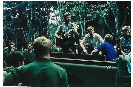
Lucky & Fellow Performers in Vietnam

The cost remains the same at just $50.00pp which includes morning tea from 11am, a delicious two course lunch and all entertainment.